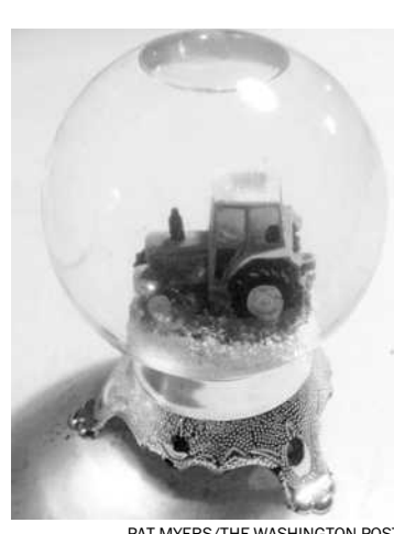
Try not to be good/bad enough to finish second — and win this.

● THE STYLE CONVERSATIONAL The Empress's weekly online column discusses each new contest and set of results. Especially if you plan to enter, check it out at wapo.st/styleconv.